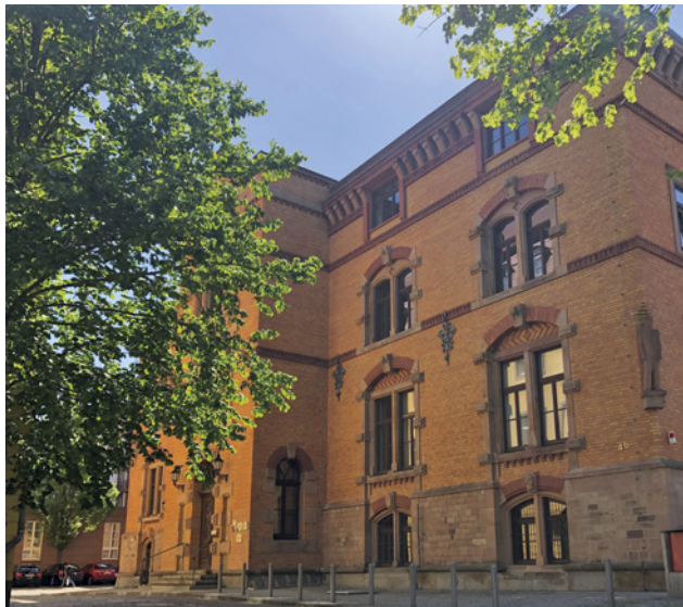
Public Health Department in the Oberaltenburg in Merseburg

In special cases house visits are possible. Please do not hesitate to contact us!